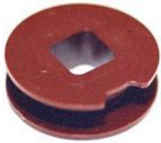
122F & FH Twist-R-Lock Fitting For all depanner cups.