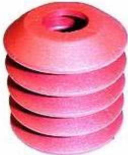
#118 & 119