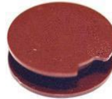
122FP & FPH Twist-R-Lock Fitting Plug. Metal Detectable

100 pcs/bag 1-25 bags $48.50 ea. 26-100 bags 44.00 ea. 101+ bags 40.00 ea. (List Price $60.00 ea.)